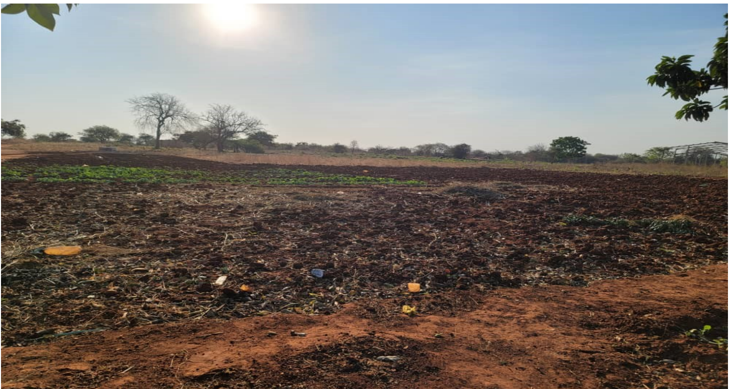
Prepared Land for Soya Beans