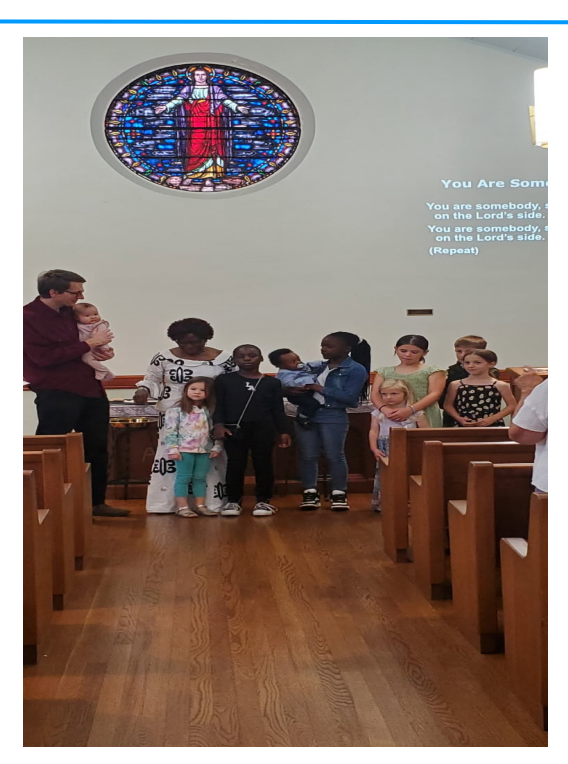
Father's Day -June 15, 2025